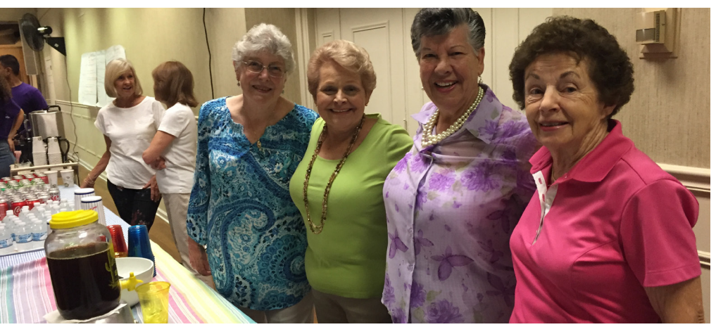
Women's Association Chapters 8 and 9