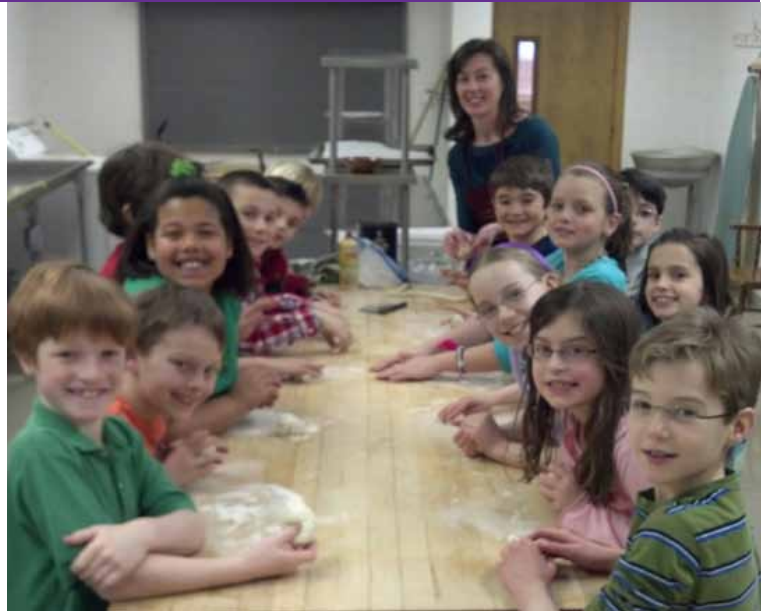
3 rd grade Sunday school class making Lenten pretzels on Sunday, March 17

Thus the pretzel is the most appropriate food symbol in Lent. It still shows the form of arms crossed in prayer, reminding us that Lent is a time of prayer. It consists only of water and flour, thus proclaiming Lent as a time of fasting. The earliest picture and description of a pretzel (from the fifth century) may be found in the manuscript-codex No. 3867, V.